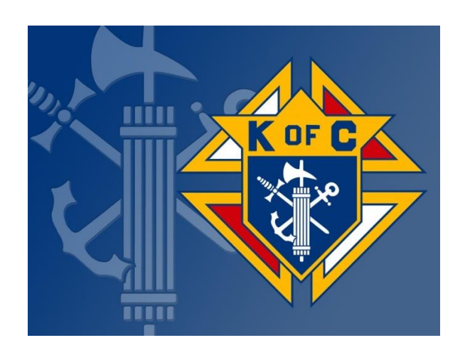
KNIGHTS OF COLUMBUS COUNCIL 13181 – SABATTUS, MAIN

Knights of Columbus Council 13181 131 High Street Sabattus, ME 04280